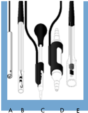
3200 series cells with built-in temperature sensors (see chart on back)

YSI 3200 Series Conductivity Cells have built-in thermistors, allowing automatic temperature compensation. All YSI cells are calibrated according to OIML (International Organization of Legal Metrology) recommendations 56 (Standard solutions reproducing the conductivity of electrolytes) and 68 (Calibration method for conductivity cells).